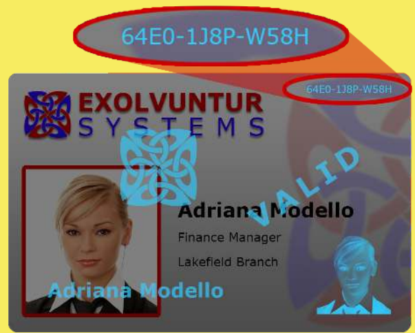
Closeup of Unique Machine Code

High resolution gradient UV printing is more cost-effective than custom holographic laminate and doesn't require additional hardware or expensive readers. It can be viewed with any normal UV flashlight.