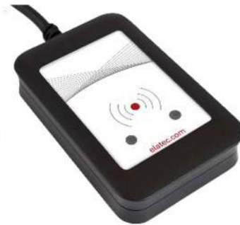
Desktop version (inlay customizable)

Elatec's TWN4 family of transponder readers and writers allows users to read and write to almost any 125 kHz, 134.2 kHz and 13.56 MHz tags and/or labels. It supports all major transponders from various suppliers like ATMEL, EM, ST, NXP, TI, HID etc. and ISO standards like ISO14443A/B (T=CL), ISO15693, ISO18092 / ECMA-340 (NFC).