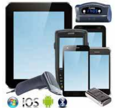
iPad and iPhone are trademarks of Apple.

EPIC Track is Easy. It's software is intuitive, requiring minimal training and smooth implementation throughout any organization. With EPIC Track, there are no servers to configure, it has a simple user interface, and contains prebuilt reports. It's basic design makes EPIC Track the perfect tool for any number of tracking scenarios, making it a cost effective and value added solution. EPIC Track can easily be integrated with mobile devices such as smart phones, handhelds, tablet PCs, and desktop PCs supported by Apple, Android and Windows operating systems. This out of the box tracking solution makes deployment simple, fast and successful every time.